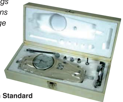
MF in Standard Carrying Case