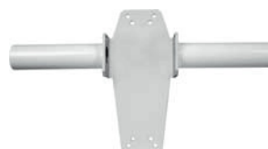
Optional MFP-Handle Ideal for Heavy Loads

*Note: Additional accessory adapters available. Please contact the factory.