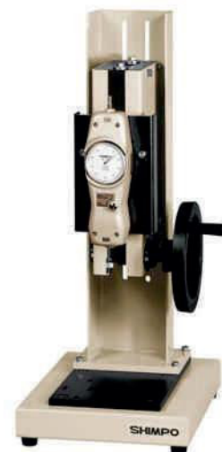
MF with FGS-100H Manually Operated Test Stand (sold separately)