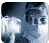
Laboratory / R&D