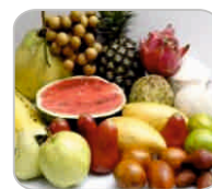
Fruits & Vegetables