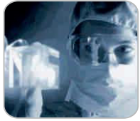
Laboratory / R&D