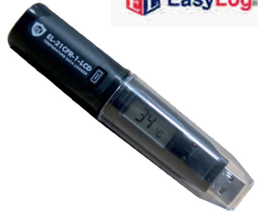
Model : EL-21CFR-1-LCD