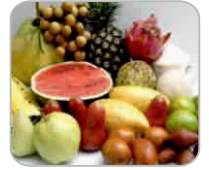
Fruits & Vegetables

This 21CFR-compliant standalone data logger measures more than 16,000 readings over a -35 to +80°C (-31 to +176°F) range. At the touch of a button, use the on-board display to cycle between the current, minimum and maximum temperature logs seen during the session.